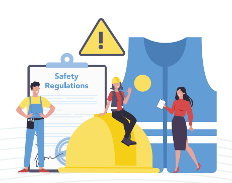
GRI 403-9: Work-Related Injuries

SASB Standards Road and Rail Transportation: TR-RO320a.1 & TR-RA320a.1